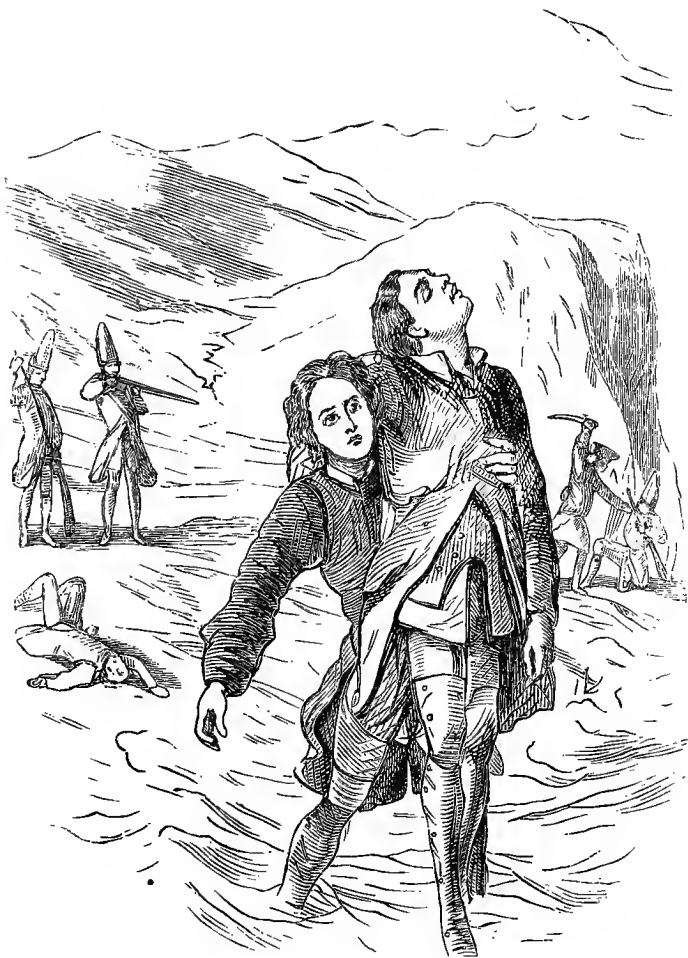
A Run for the Boats.